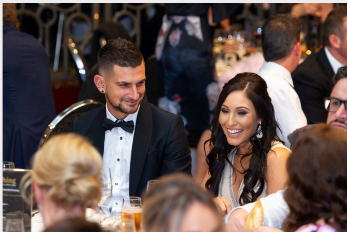
Fletchers Awards Night, 2018

Though times have changed, Fletchers underlying values have not and we pride ourselves on our commitment to delivering an excellent level of service to our clients and community partners.